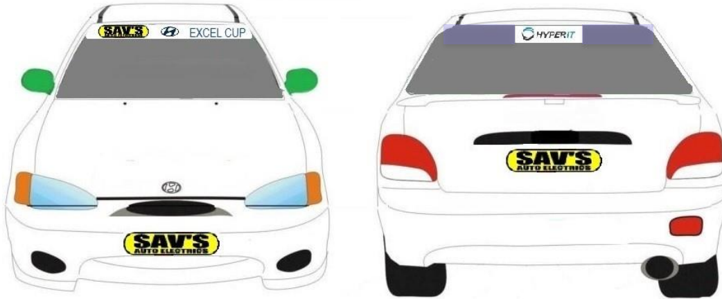
Front and Rear Decal Locations