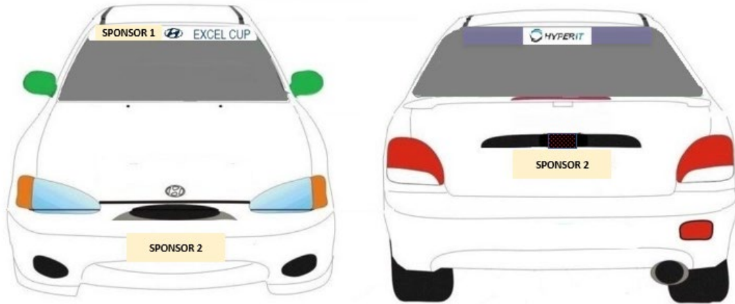
Front and Rear Decal Locations